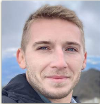
Message from the CCF Board Vice-Chair

We have always said at CCF that we want to work ourselves out of a job. In 2023, with your help, we've made good progress on this goal in the best way possible. This year, we celebrated the graduation of the Baseri Clinic (our oldest project) into an official government run healthcare center, and the successful creation of a financial endowment for one of our biggest endeavors to date: the Girl's Education Program – an endowment which will ensure the stipends this program provides will serve Nepali girls far into the future.