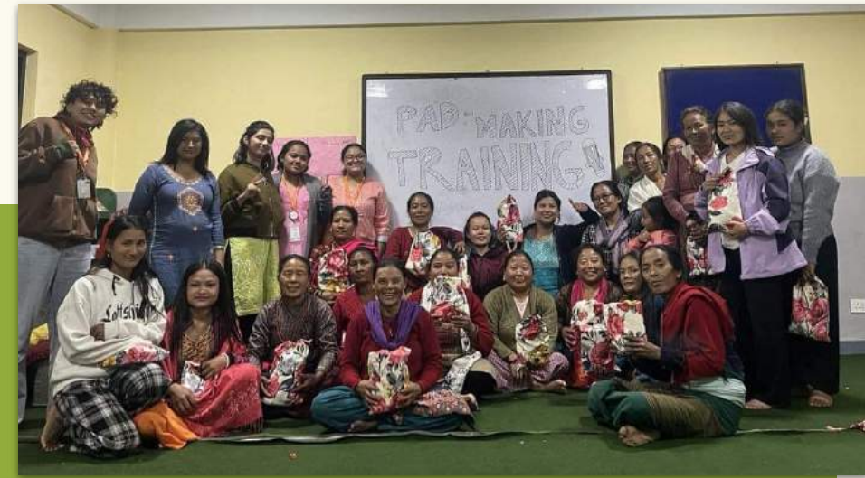
BSW students teach villagers about Menstrual Hygiene (above) and learn how to sew their own pads (below)

The students found that villagers had very little understanding of menstruation and felt that the basic menstrual health training and reusable menstrual kits were very valuable. They are excited to partner again with CCF in the future.