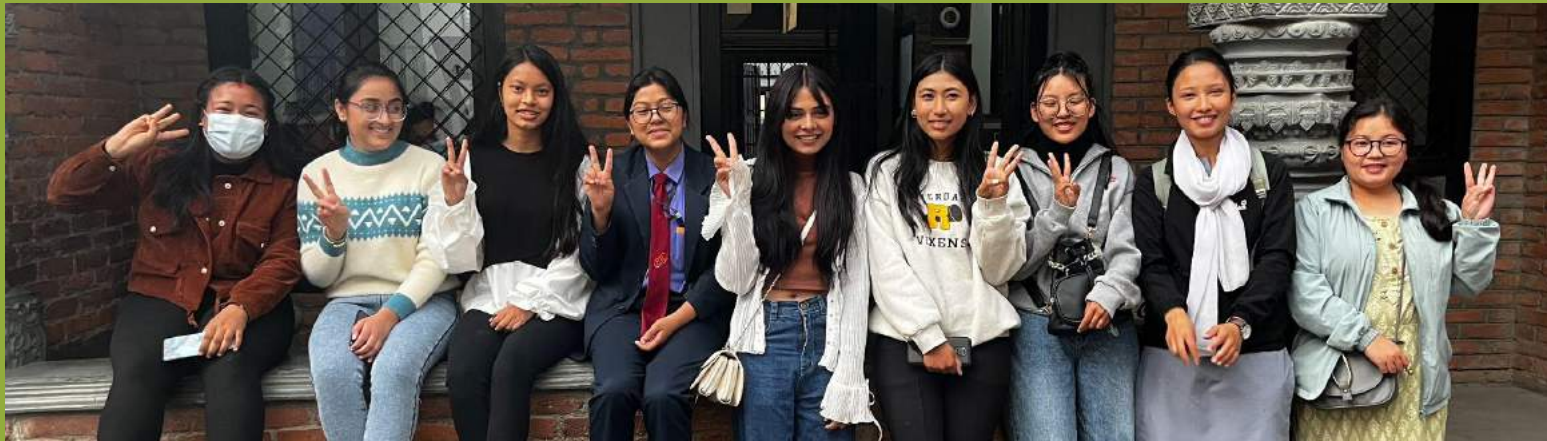
Gathering of past & present Joy Attwood scholars in 2023

CCF partners with Nepali organizations that help struggling families keep their girl children in school without any cost to the family. Every eligible family receives $10/month as an educational stipend and in return they provide monthly evidence of the girl's attendance and progress in school. The program's focus is on girls but boys in need are not excluded.