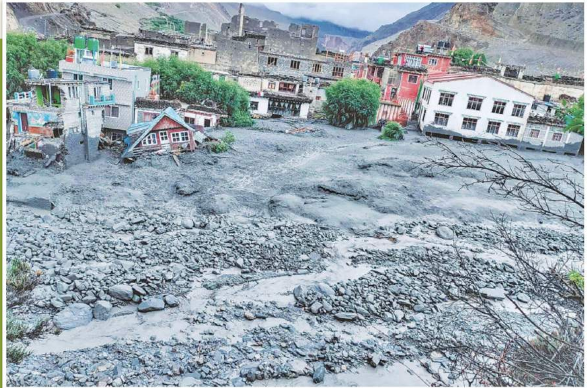
The flooding of the Kag river swept away 29 structures including homes and hotels and caused damage to 13 more in Kagbeni in Mustang on Sunday evening. Scores of people have been displaced. The mud debris brought by the river either buried homes or washed them away.